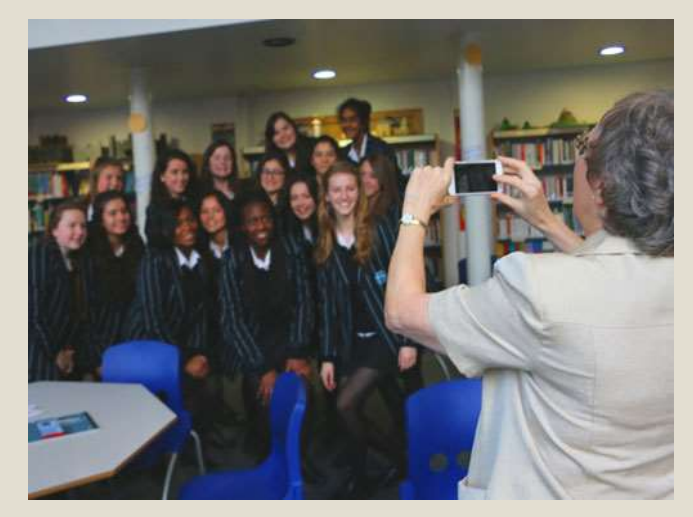
TenTen Drama Group UK