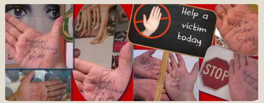
RENATE Campaign on Line – EU day Against Trafficking