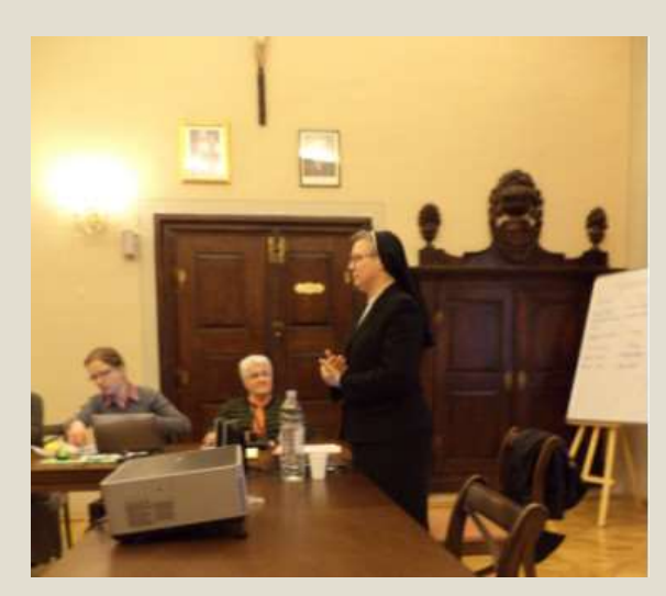
Supporting a loan member in Croatia

2018: Membership in 29 European Countries – 15 in E. Europe 14 in W. Europe