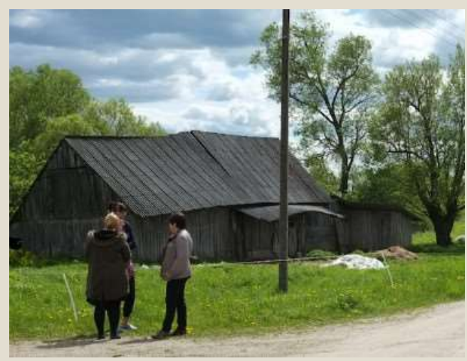
Cross border work in Lithuania