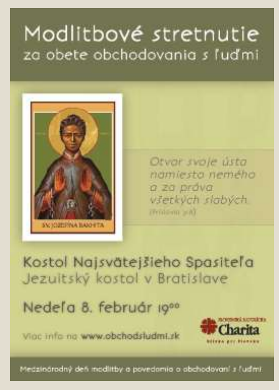
St Bakhita Day: Slovakia