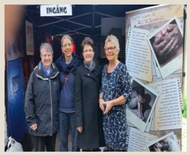
Latest Member from Denmark